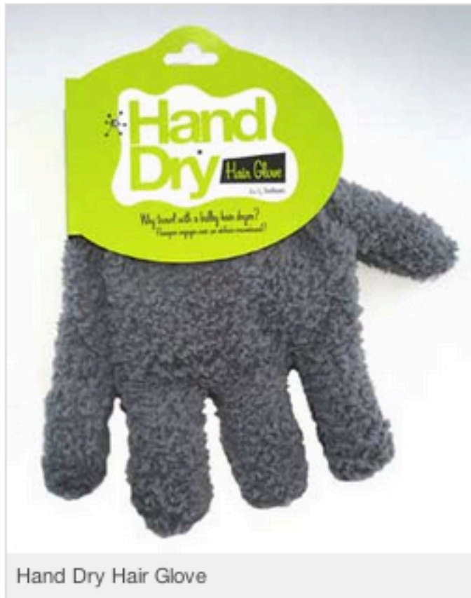
Hand Dry Hair Glove

One of the more interesting, not to mention fun-to-use, innovations for the curly world has to be the Hand Dry Hair Glove.