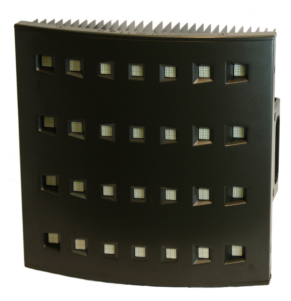
ProFlex 28 LED floodlight

Brenneman and team are so impressed with the ProFlex lights that they have plans to use them to illuminate the resort's lazy river area in an upcoming project.